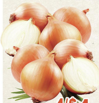
Brown Onion Cebolla Café